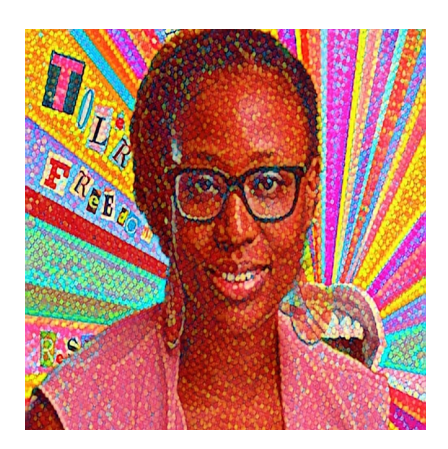
"I Hate Black History Month," Pinkie Points It Out