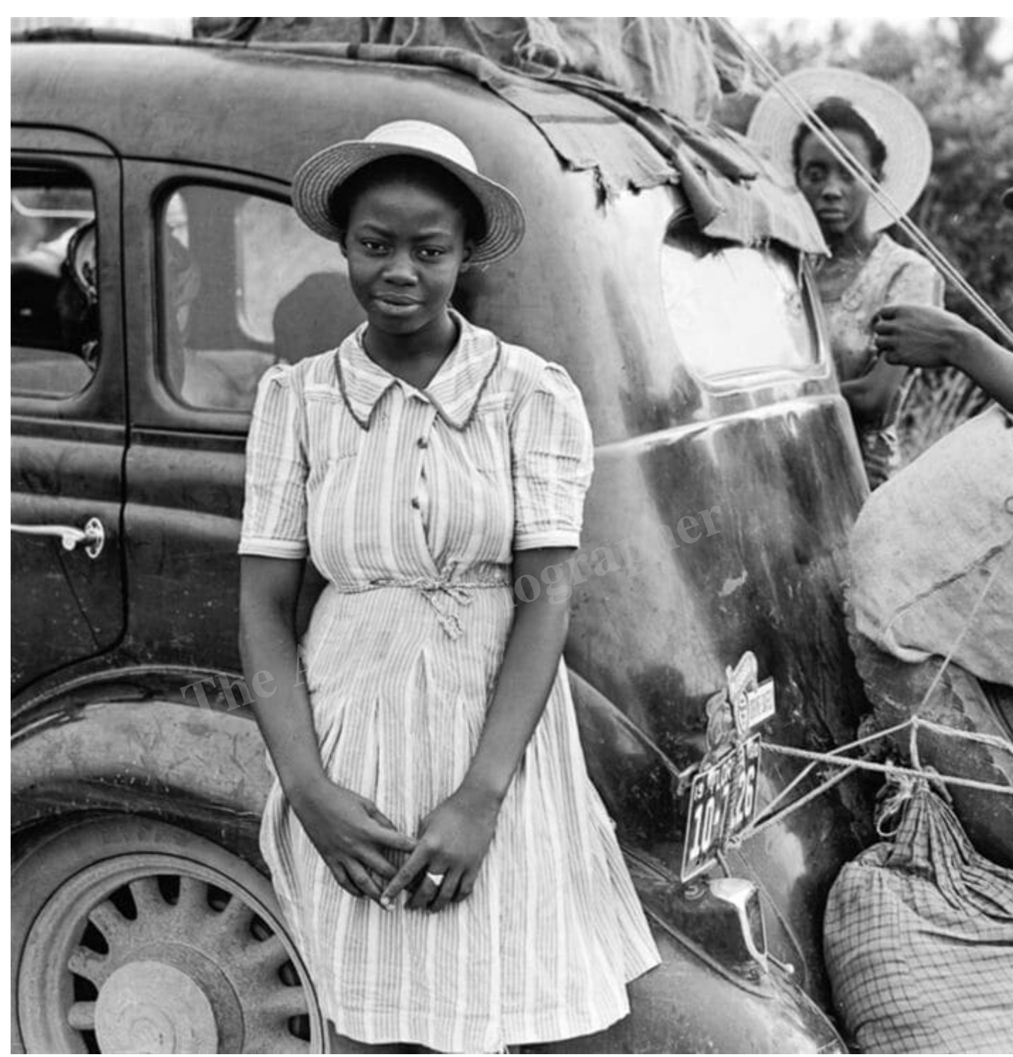
African American Florida Family Going to NJ to Pick Potatoes, Jack Delano, 1940, public domain

It's Black History Month 2023, and another Black man has been murdered by five police officers, all of whom are Black. Now, I'm not going to rehash the gruesome details of Tyre Nichols' murder. I don't have to. You already know what it looks like. You watched the disturbing video, didn't you?